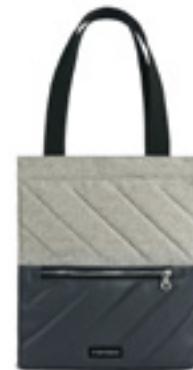
TOTE // STX8414