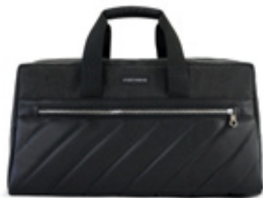
WEEKENDER // STX8213