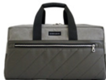
WEEKENDER // STX8214