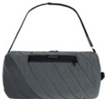
DUFFLE // STX8313