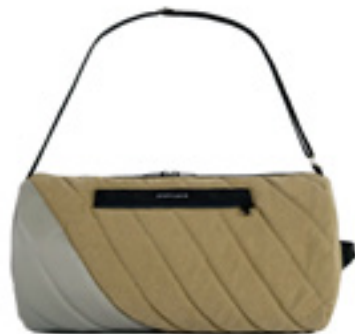
DUFFLE // STX8314