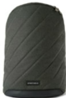
BACKPACK // STX8115