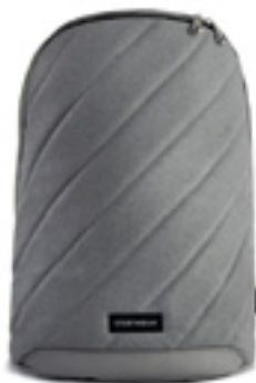
BACKPACK // STX8114