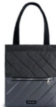
TOTE // STX8415